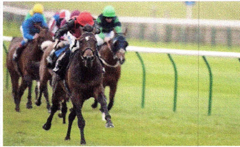
Trumpet Major is now as short as 6-1 for the Qipco 2,000 Guineas