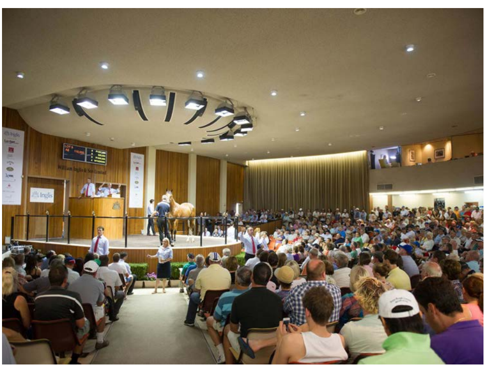
Oaklands Junction, Melbourne