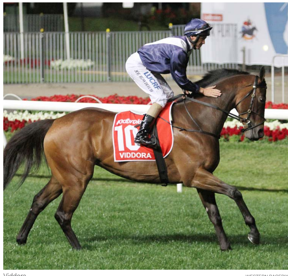
Viddora

Favourite for the race, Rock Magic (Redoute's Choice) [109] ran on well from the tail of the field for fifth but was found to have