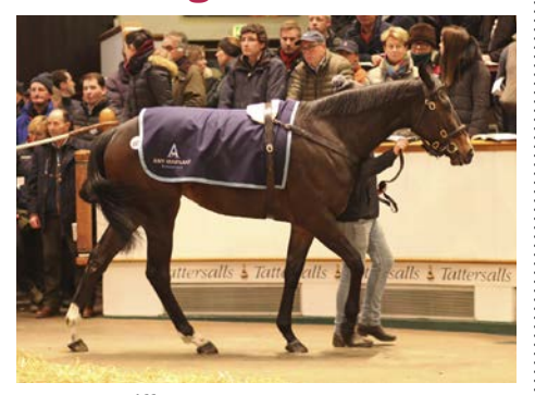
Lot 1836 Different League