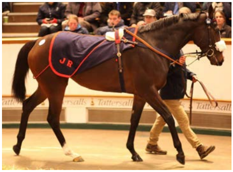
Lot 1861 Quiet Reflection